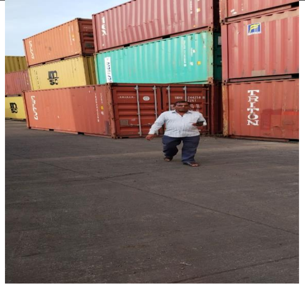
INSPECTION AT ICD TIHI BY PQ INSPECTOR FOR IMPORT