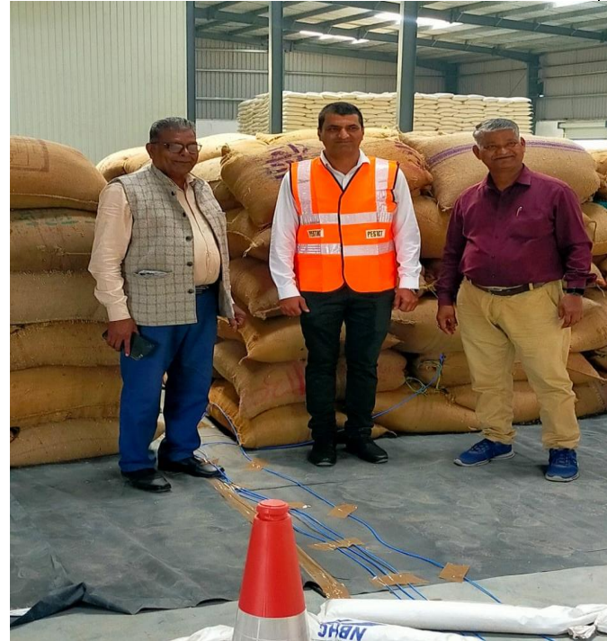
INSPECTION OF PROCESSED COMMODITY SOYA LECITHIN AT EXPORTERS PLANTS