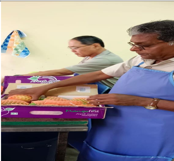
INSPECTION OF MANGO FOR EXPORT AT LASALGAO. PQS NASIK WHILE DEPUTATION