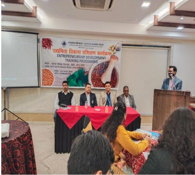
SPICE BOARD & PQ OFFICERS TECHNICAL MEETING GLIMPSE CONSIGNMENT