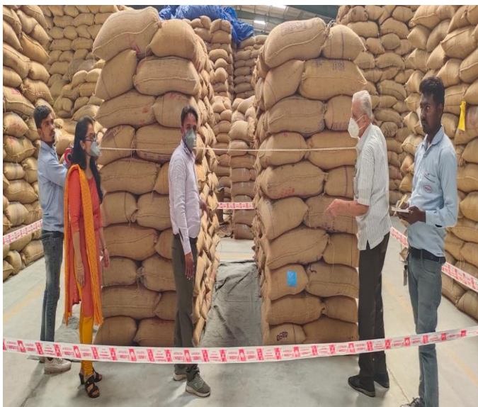
PLACEMENT OF ALP TABLETS IN GODOWN AT VIPPY INDUSTRIES