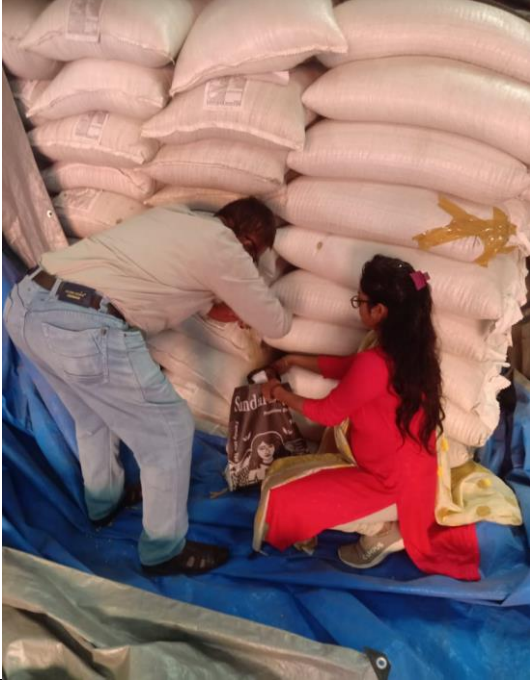
RE-INSPECTION OF CONTAMINATED SOYBEAN WITH SOIL, PLANT DEBRIS AND STONES