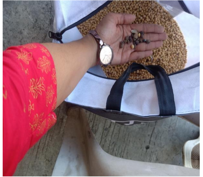
COMPOSITE SAMPLE OF SOYBEAN WITH CONTAMINANTS